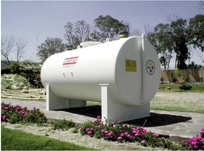
2-Hour 2000° Fire-Tested Performance

FLAMESHIELD® aboveground storage tanks are manufactured with a tight-wrap double-wall design. Standard features include 2-hour fire-tested performance, built-in secondary containment and interstitial monitoring capability.